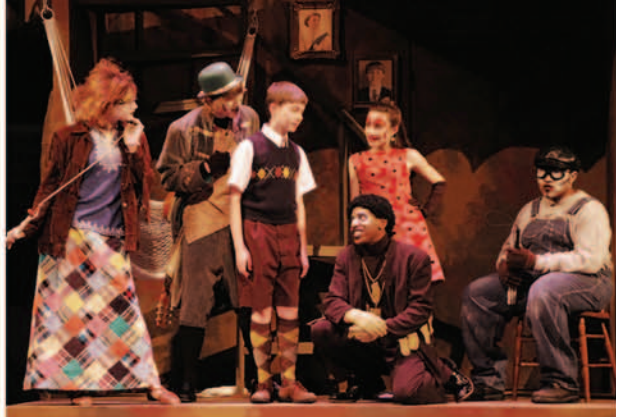
JAMES AND THE GIANT PEACH (2009)

NON-PROFIT ORGANIZATION US POSTAGE PAID KALAMAZOO, MI PERMIT NO. 714