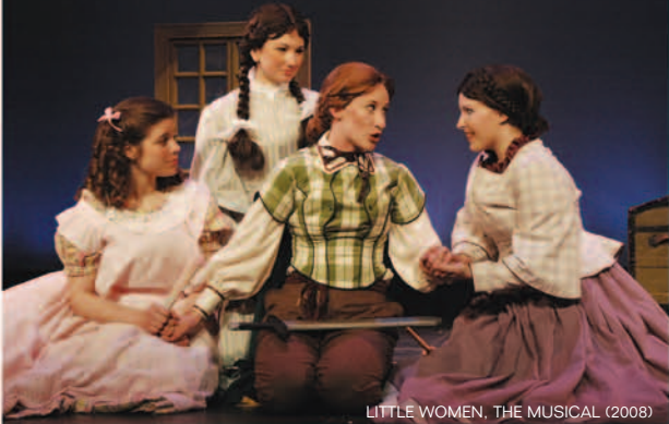
LITTLE WOMEN, THE MUSICAL (2008)

START PLANNING YOUR NEXT THEATRE PARTY TODAY!